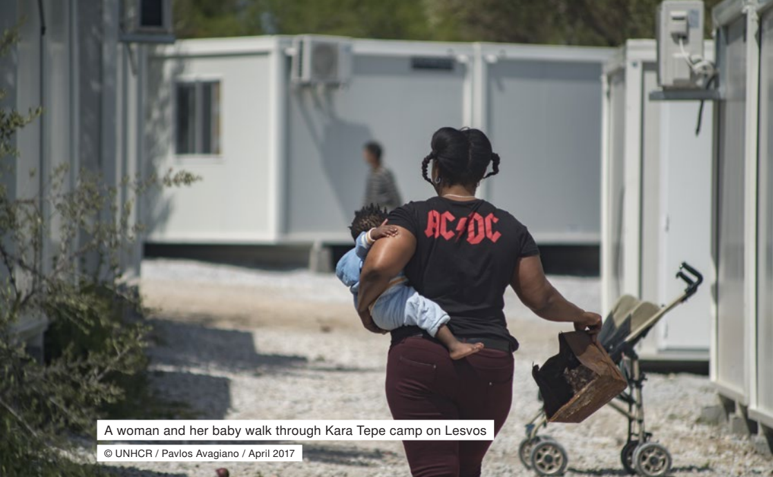
A woman and her baby walk through Kara Tepe camp on Lesbos