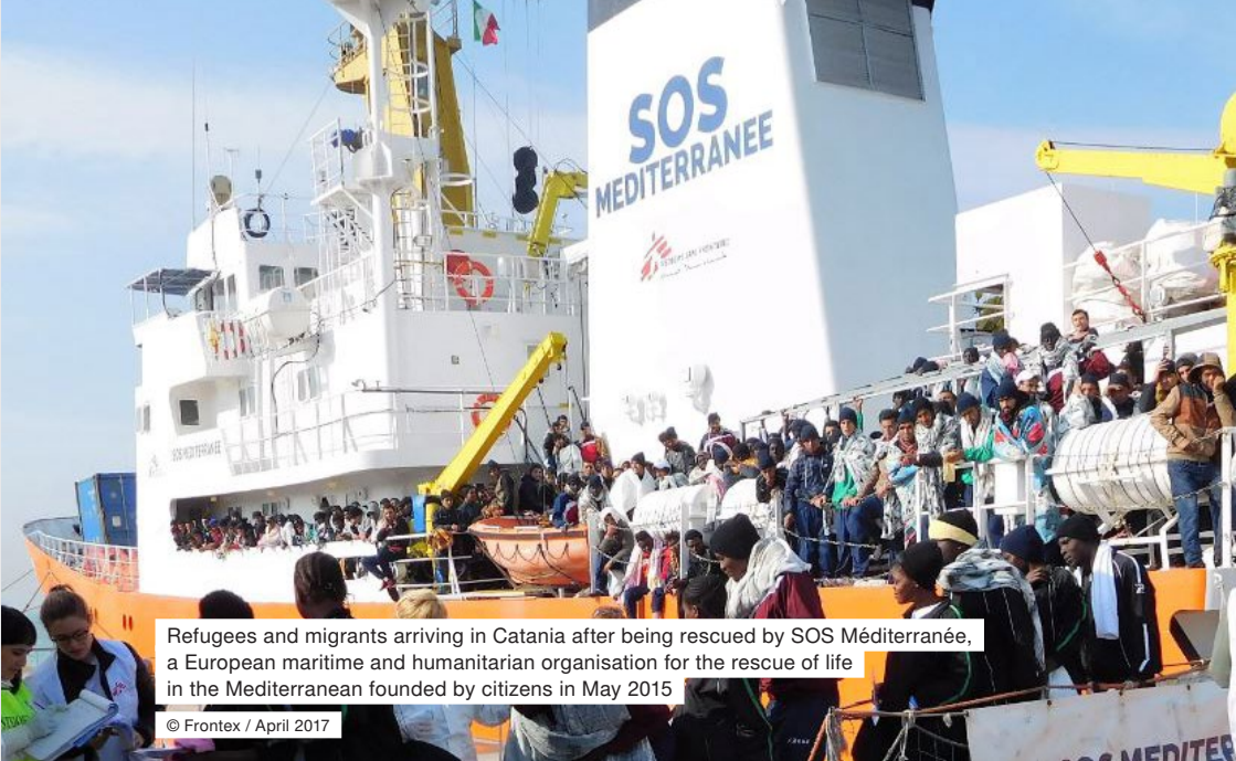
Refugees and migrants arriving in Catania after being rescued by SOS Méditerranée, a European maritime and humanitarian organisation for the rescue of life in the Mediterranean founded by citizens in May 2015