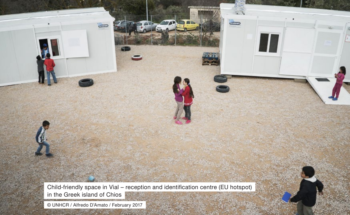
Child-friendly space in Vial – reception and identification centre (EU hotspot) in the Greek island of Chios

© UNHCR / Alfredo D'Amato / February 2017