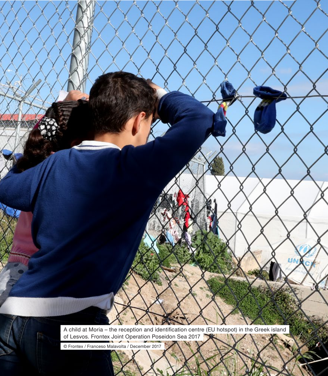
A child at Moria – the reception and identification centre (EU hotspot) in the Greek island of Lesbos. Frontex Joint Operation Poseidon Sea 2017