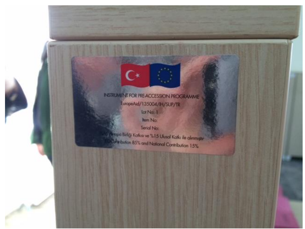
Sign showing EU 85% funding through the Instrument for Accession programme (sign visible on all furniture, towels, etc.)

The centre was financed (85 per cent) as a reception centre by the EU under the Instrument for Accession programme, but before it even opened, it was decided that the centre would be repurposed in the last quarter of 2015, and it was turned into a removal centre.