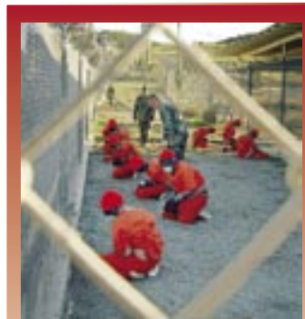
Taliban and al-Qaida detainees sit in a holding area at Camp X-Ray at Guantanamo Bay, Cuba, during in-processing to the temporary detention facility in this Jan. 11, 2002 file photo. Controversy over prisoner abuse at U.S.-run prisons in Iraq and Afghanistan has left the Guantanamo Bay, Cuba, detention facility for terrorist suspects largely untouched. but that may soon change. A senior Navy admiral who briefly visited Guantanamo Bay in early May has recommended a more in depth look at how prisoners were treated there.

Through the G8 and other international groupings, they lobby for the introduction of “pre-terrorist” offences in jurisdictions across the world, allowing people to be locked-up by state-run courts on the basis of secret intelligence from the intelligence services.