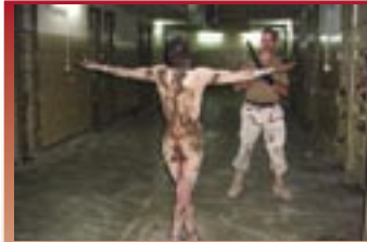
In this undated still photo provided by The Washington Post on Friday May 21, 2004, a naked Iraqi detainee appears to be cuffed at the ankles and covered with an unknown substance under the guard of a baton-wielding U.S. soldier at the Abu Ghraib prison on the outskirts of Baghdad. The Washington Post has obtained what it says are hundreds of photographs and short digital videos - as of yet unreleased - depicting U.S. soldiers physically and emotionally abusing detainees last fall in the Abu Ghraib prison.

detention without trial. Nevertheless, people remain locked in cages and windowless cells in both countries. Rather than release or charge detainees, the governments of both countries are working to legitimise their further detention.