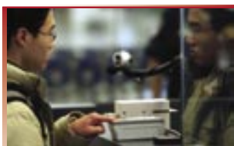
In the name of combating terrorism, for instance, hundreds of millions people will be fingerprinted in the coming decade.

Whether we like it or not, authorities around the world are engaged in a process of monitoring and tracking our movements. It is not just journalists whose activities are increasingly under scrutiny. The compilation of massive databanks of personal information, the surveillance of internet and personal communications, and the profiling of