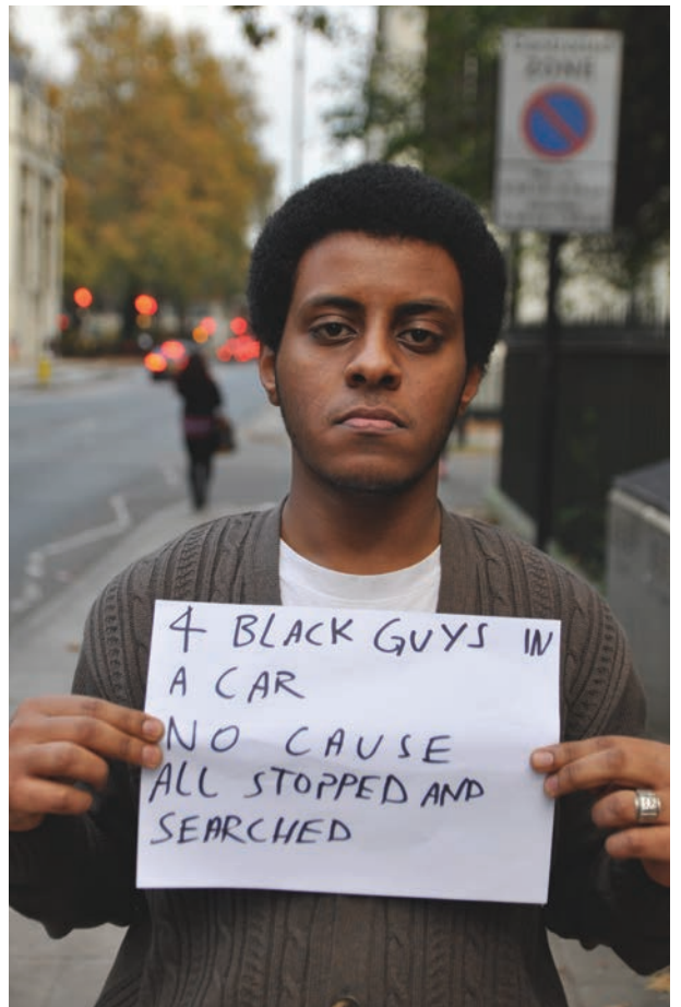
Stop and search - Zekarias"

During the checks, what do I think about? As it is, when this happens, there are always people walking around. People start staring at you. 'What is Adil doing with the police?', 'What are those guys doing with the police?' or 'What do the police want with them?', 'What have they done this time?' How do the police see me? They just see me as a Moroccan, like all the other Moroccans, and that just makes you feel really bad. It's like you have to scream for your rights even though they are doing you wrong. That feeling is really frustrating. It destroys something inside of you. I don't feel protected by the police. It's more like I feel I have to protect myself from them in some situations. They don't listen to you as a citizen in those situations. It's because people, the police, paint that picture again: 'Yes, it's a Moroccan.'12