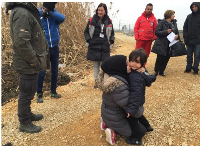
Miratovac: Syrian refugee reunited with her 4 y.o. son following three days' separation

■ 9 y.o. girl, separated from her family in FYR Macedonia, was traced by SC with the support of colleagues from Greece and identified in Serbia at Adaševci RAP. In cooperation with the local authorities, this girl was placed in the care of a foster family and the reunification process was initiated by UNHCR.