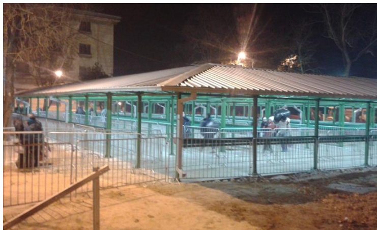
Preševo: Covered pre-registration waiting area at the Reception Centre, Photo@UNHCR