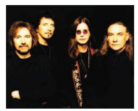
Rock band Black Sabbath (OBJ Black Sabbath)