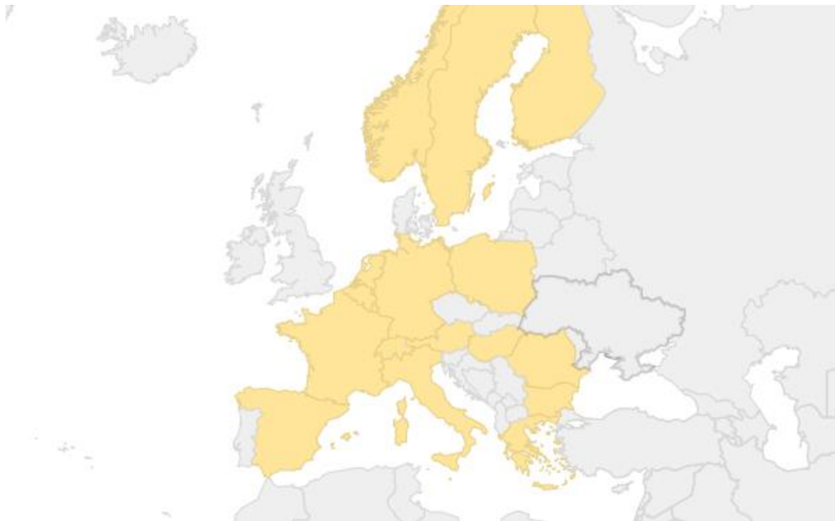
Figure 1 – Austria, Belgium, Bulgaria, Finland, France, Germany, Greece, Hungary, Italy, Luxembourg, Malta, Netherlands, Norway, Poland, Romania, Spain, Sweden, Switzerland

Since September 2015, 683 people have been deported in joint Frontex flights from 18 Member States. [1] 1