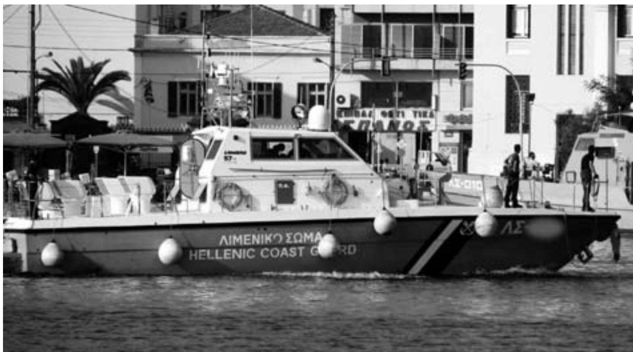
Boat of the Lesbos coast guard showing mount for a machinegun on its prow.

Even the head of the coast guard Mikromastoras confirms that, secretly, refugees are brought back to the Turkish coast, even after they have been on Greek