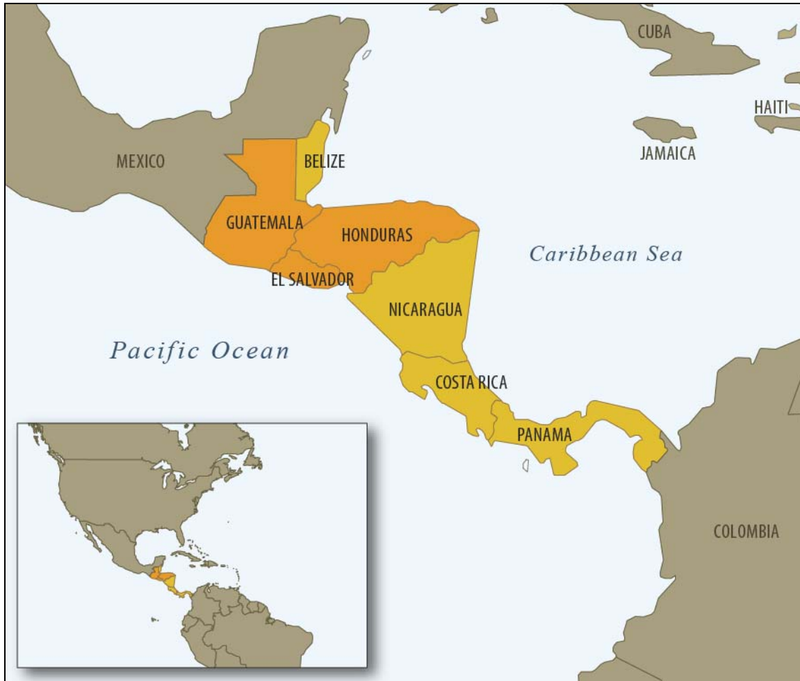
Figure 2. Map of Central America and Neighboring Countries

Source: Prepared by Amber Hope Wilhelm, CRS Graphics Specialist.