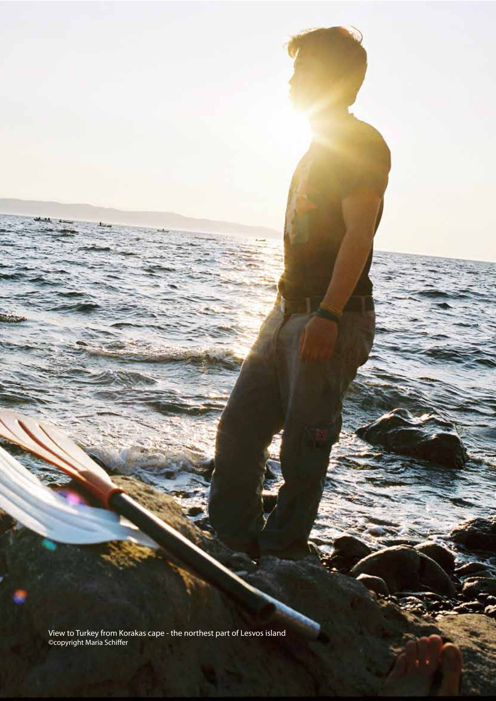
View to Turkey from Korakas cape - the northeast part of Lesbos island