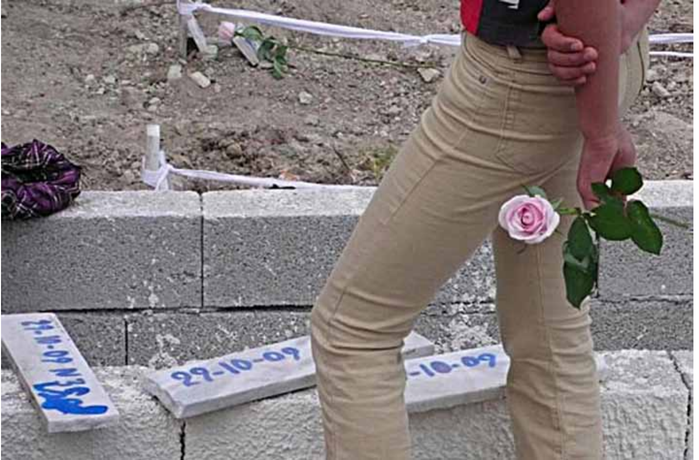
Burying the victims of the borders in Lesbos

'The officers waved us not to make any noise. We know from others that they always do like that and that when there are Turks from the other side, they take the people for a ride.' 119