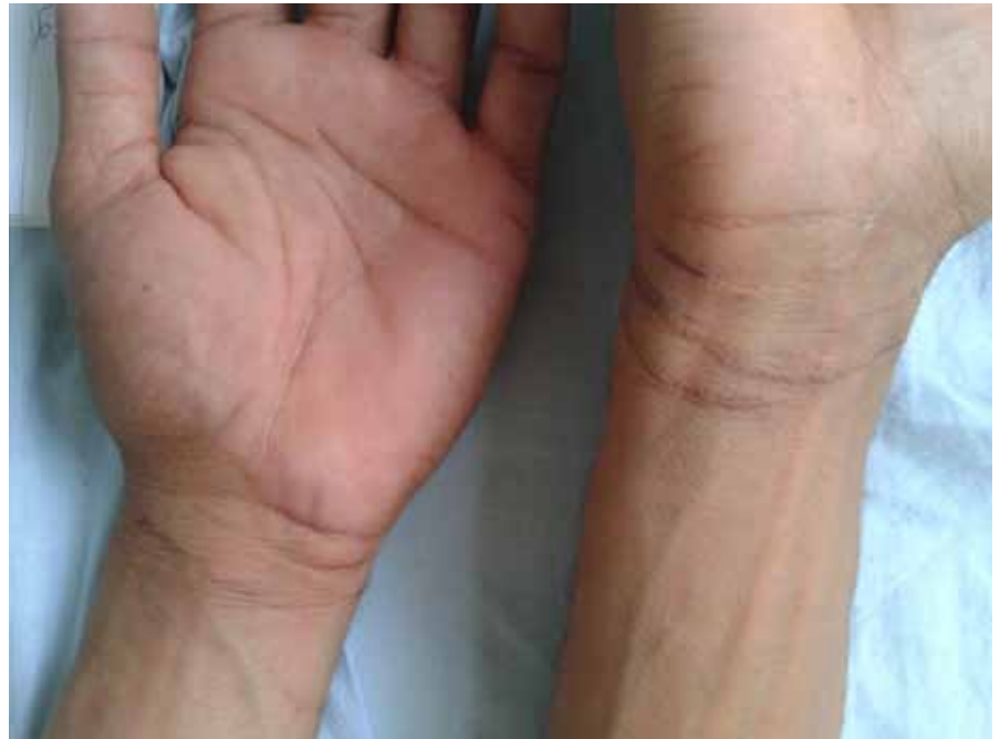
Signs left from the handcuffs. One of the interviewee's had a black eye, but didn't want Pro Asyl to document it for obvious reasons (religious minority, suppressed and Greek authorities).

They then took us back where we were in the beginning and took off our underwear, one after the other and they beat us with a wooden stick. They kept beating us, until everyone was beaten three times. They then put plastic handcuffs in our hands and left us for seven hours with our hands handcuffed in the back under the sun.