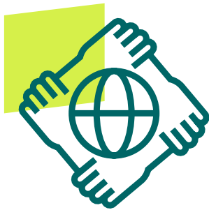
Whole of society