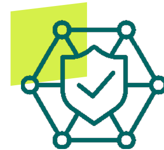
Investment in security capabilities