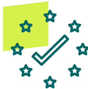
Mainstreaming of security considerations