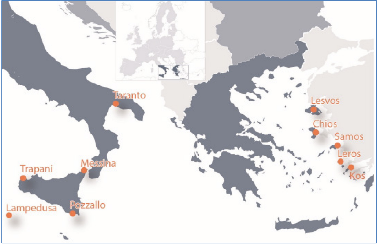
Figure 1 – EU "hotspots" in Greece and Italy