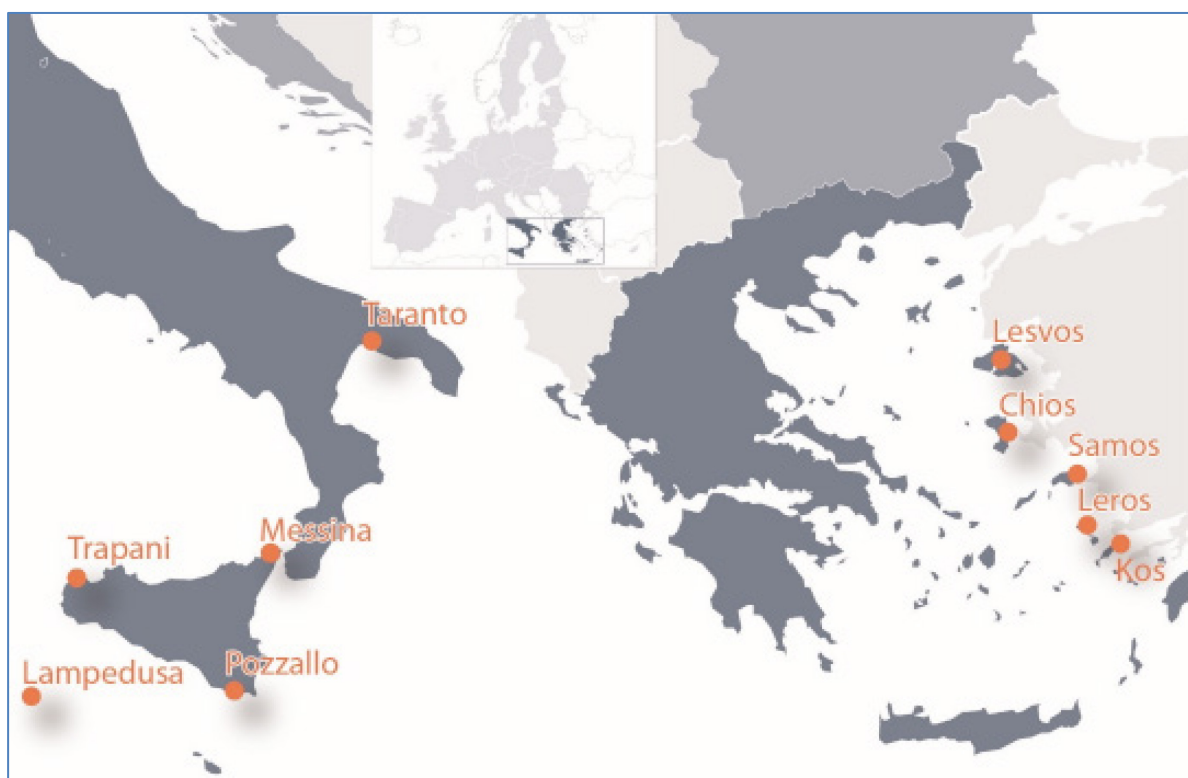
Figure 1 – EU “hotspots” in Greece and Italy