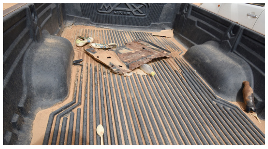
Left-overs of a journey through the desert in one of the pick-ups seized during control operations - July 2018

These policies carry an ever-increasing human cost, both for the people living in the countries