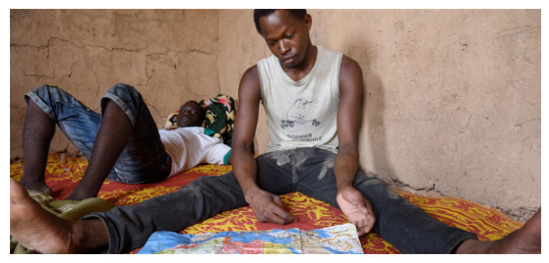
Migrants waiting to resume their journey to Libya, Agadez - July 2018

permitted the repatriation of Sudanese migrants, many from Darfur, arrested in raids in Ventimiglia, on a charter flight from Turin to Khartoum on 24 August 2016: that expulsion was the proving ground for the agreement signed just days before.