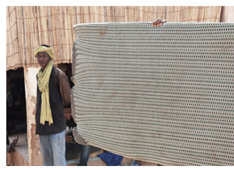
Migrants in the IOM centre, Agadez - July 2018

In a country with porous borders and surrounded by conflicts and riots - the