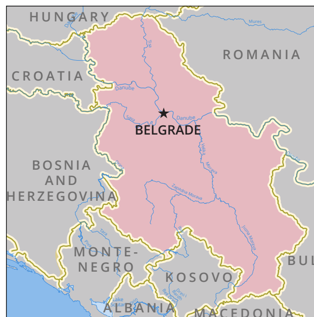
Figure 7: Map of Serbia