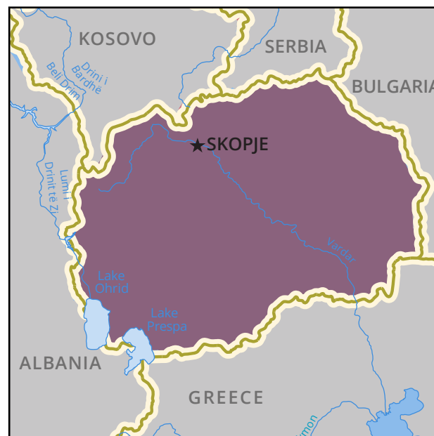
Figure 5: Map of Macedonia