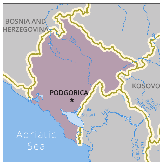
Figure 6: Map of Montenegro