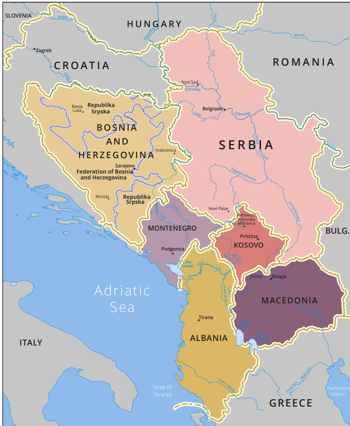
Figure 1: Map of the Western Balkans