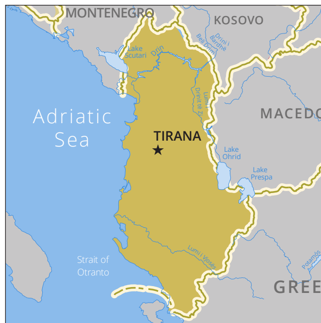
Figure 2: Map of Albania