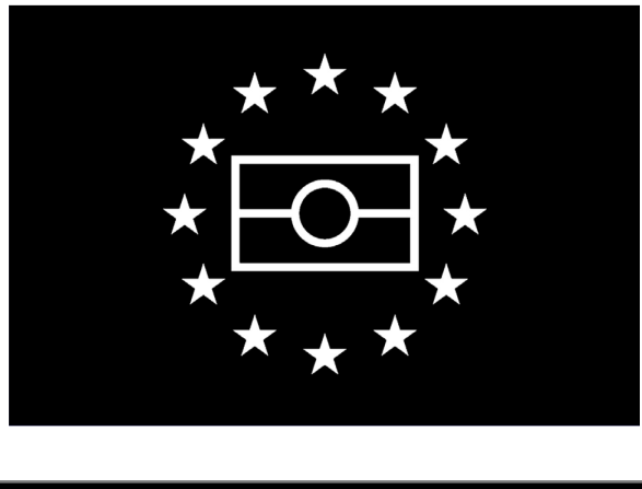
Part D1: Automated border control lanes for EU/EEA/CH citizens