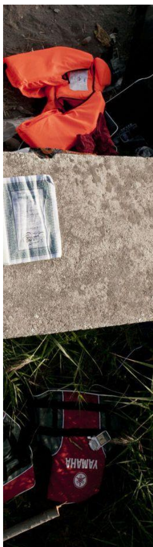
Photo 2 Belongings and documents found on the shores of Lesbos

Still there is a tension between legal duties and the realities of a complex humanitarian challenge. At the peak of the refugee crisis it was practically impossible for the understaffed coastguard to carry out such an investigative operation. In the last half of 2015 the daily arrivals of refugees ranged between 2,000-3,000, 29 and therefore it would be unreasonable to expect from an under-resourced state agency at a remote Greek island mandated to collect and register thousands of living migrants, to search for and rescue the missing, to deal with the dead bodies, and at the same time to carry out a systematic and time-consuming investigation to collect and store post-mortem data from shipwrecks. Yet, according to all available information lack of provision for collecting post-mortem data was prevalent even in the previous years (2013-2014) at a time when the few shipwrecks made the collection and storage of this data more feasible. As such this should be seen both as the objective challenges of a complex humanitarian challenge and a continuation of a bad practice.