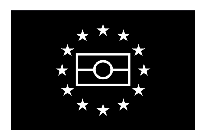
Part D1: ABC lanes for EU/EEA/CH citizens