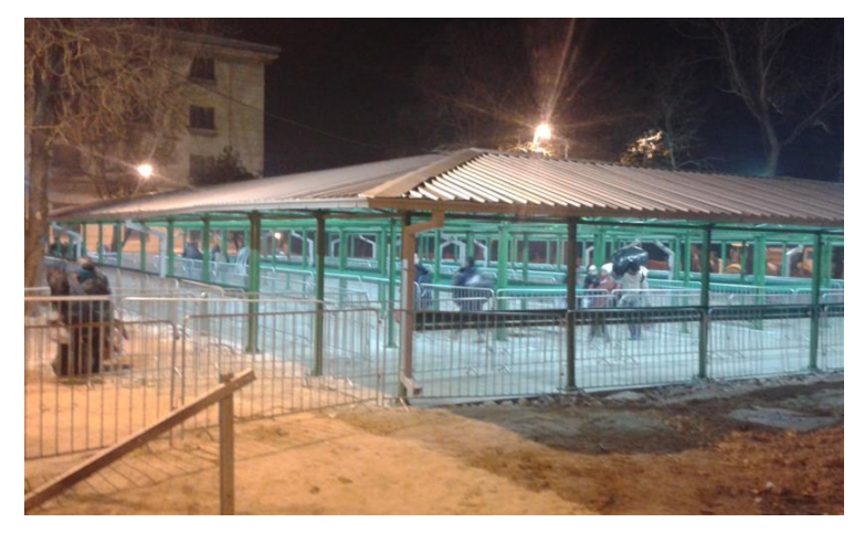
Preševo: Covered pre-registration waiting area at the Reception Centre,