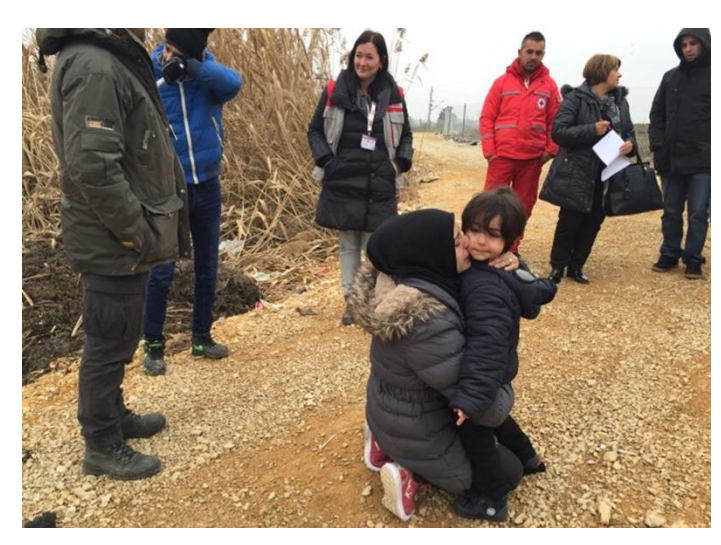
Miratovac: Syrian refugee reunited with her 4 y.o. son following three days' separation