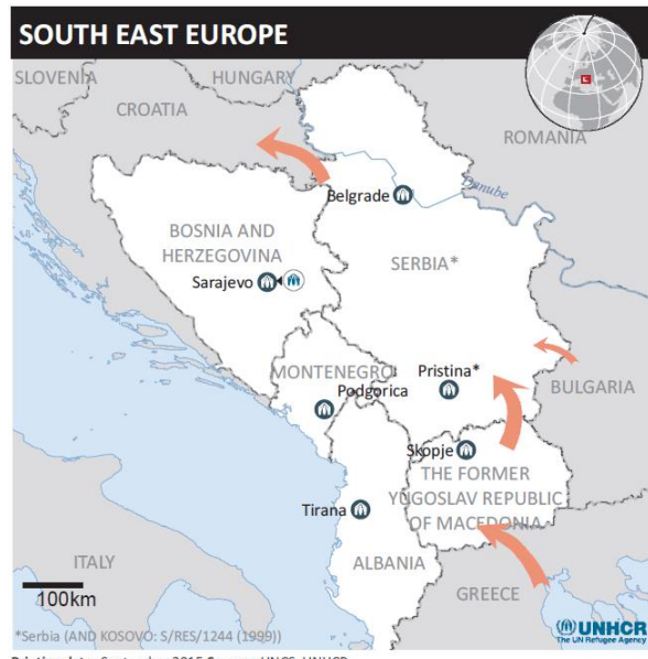
Printing date: September 2015 The boundaries and names shown and the designations used on this map do not imply official endorsement or acceptance by the United Nations.

expressed intention to seek asylum in the Republic of Serbia in 2015 as at 31 December.