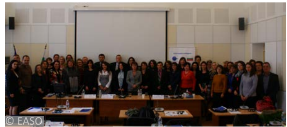
Workshop on European law related to asylum, border and immigration in Sofia, Bulgaria

NIJ and EASO will continue to cooperate under the Special Support Plan to provide regular professional development opportunities and dialogue for judges, prosecutors and SAR legal advisors within Bulgaria and at an EU-level.