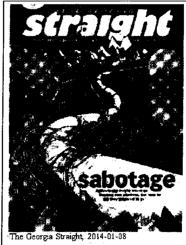
The Georgia Straight, 2014-01-08

Some pipeline opponents view the expansion of the Canadian pipeline network that will support the Oil Sands as a major contributor to global climate change. They argue the pipeline would increase carbon emissions by accelerating the pace of oil sands development, which releases more greenhouse gas emissions than the production and refining of more conventional types of crude. Others are focused on local concerns over the impact on land and water in the event of a spill.