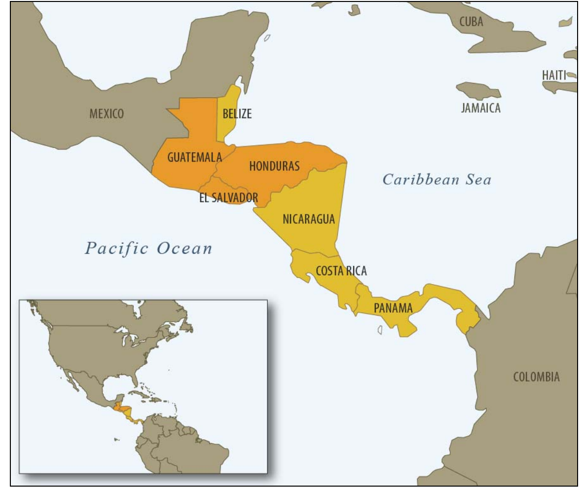
Figure 2. Map of Central America and Neighboring Countries

provided multiple reasons for leaving their countries. Many left to reunite with family or pursue opportunities in the United States. Of those interviewed, 21% mentioned joining a family member, 51% mentioned economic opportunity, and 19% mentioned education. 12