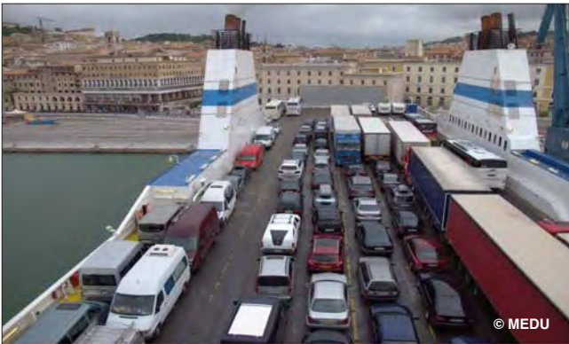
A ferryboat arriving in the Italian port of Ancona (May 2013)

From the official data detailing the first half of 2013 we can see that only half of the aliens detained at the Adriatic frontier posts was offered access to social and legal aid, as required by Italian legislation and provided by caregiving organizations present in all ports in line with the dispositions of the local Prefectures. This issue appears especially serious in those ports where caregiving NGOs have a reduced footprint. The reduced operating times for assistance and information services offered to migrants, and the fact that said operating times frequently clash with shipping timetables, means that approximately half of the aliens detained upon disembarkation deal exclusively with border patrol police or ancillary personnel. Thus, a crucial service for unaccompanied minors or asylum seekers is severely limited in the majority of Adriatic ports.