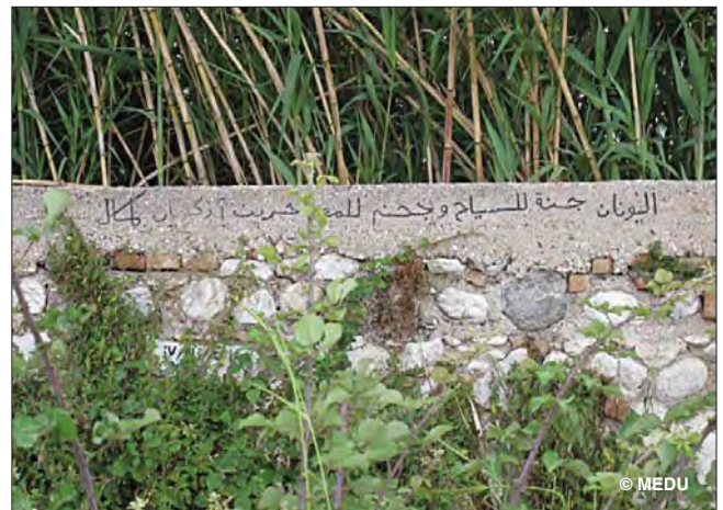
A written in Arabic in front of the new port of Patras: “Greece, a paradise for tourists, hell for migrants” (July 2013)

Medici per I Diritti Umani also believes a further reform of the Dublin Regulation by the European Union is necessary in order to ensure an adequate division of the burdens associated with the examination of requests for international protection among member states, giving preferential treatment to those factors which may connect asylum seekers with specific countries, rather than the current system of letting these fall upon the country of disembarkation. In this regard, the modifications laid out in the Dublin Regulation III, which will come into effect in 2014, do not seem sufficient in preventing the issues highlighted by this report, which have led and continue to lead to dramatic consequences for forced migrants attempting the Adriatic Route.