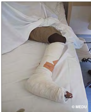
S. in the hospital of Patras with a leg in plaster (July 2013)

This investigation has further documented the acts of violence which migrants in Greece are subject to. Of the 185 migrants visited by MEDU's team in the temporary accommodation at Patras, 40% claimed to have been subjected to violence by the police (84% of cases) and xenophobic groups (16% of cases). Eighteen migrants, seven of which were minors of Afghan nationality, still bore the signs of the abuse they had suffered upon their bodies at the time of our visit.