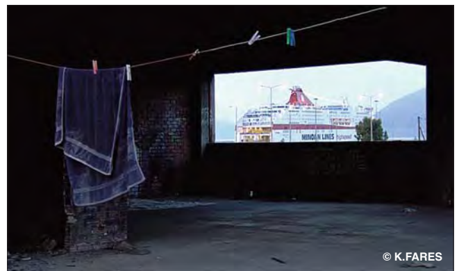
A room inside an abandoned factory used as a house in front of the new port of Patras (June 2013)

Readmissions from the Adriatic ports to Greece, which the Ministry of the Interior confirms it undertakes regularly, seem to be carried out summarily and with a grave disregard for the migrants' basic human rights by the Italian authorities, especially in the case of asylum seekers and unaccompanied minors. According to declarations made by the Ministry of the Interior, readmissions allegedly take place in accordance with the bilateral readmission agreement signed by Italy and Greece in 1999 – which, among other things, pledges both parties to respecting both the migrants' human rights and the relevant articles of the Geneva Convention on refugees. On the basis of the eyewitness accounts collected by MEDU, however, readmissions are undertaken in 80% of cases within a few hours, with the migrants being placed in the care of the vessel's Captain and returning to Greece on the same ship on which they arrived. This procedure is not countenanced in the