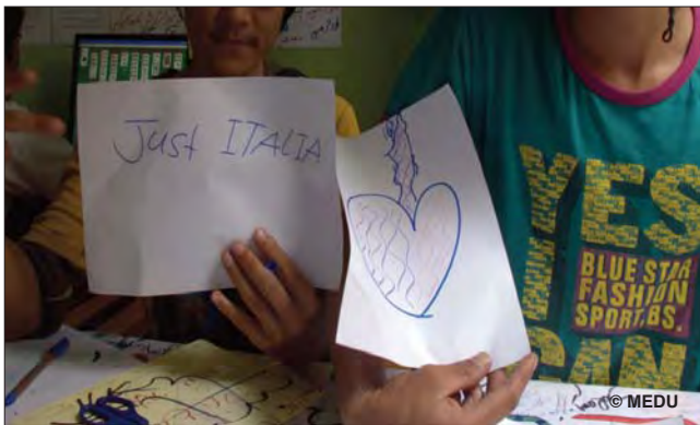
A written and a drawing made by two underage boys, readmitted in Greece as adult without being subjected to any medical examination (Patras, May 2013)

There was no translator. I talked to the harbour police using hand signals. I tried to make them understand that I wanted to stay in Italy. Using gestures, I tried to explain I was 15. They used hand signals too, to tell me "You're 20, you have to go back to Greece". M., 15 years old, Afghanistan 9