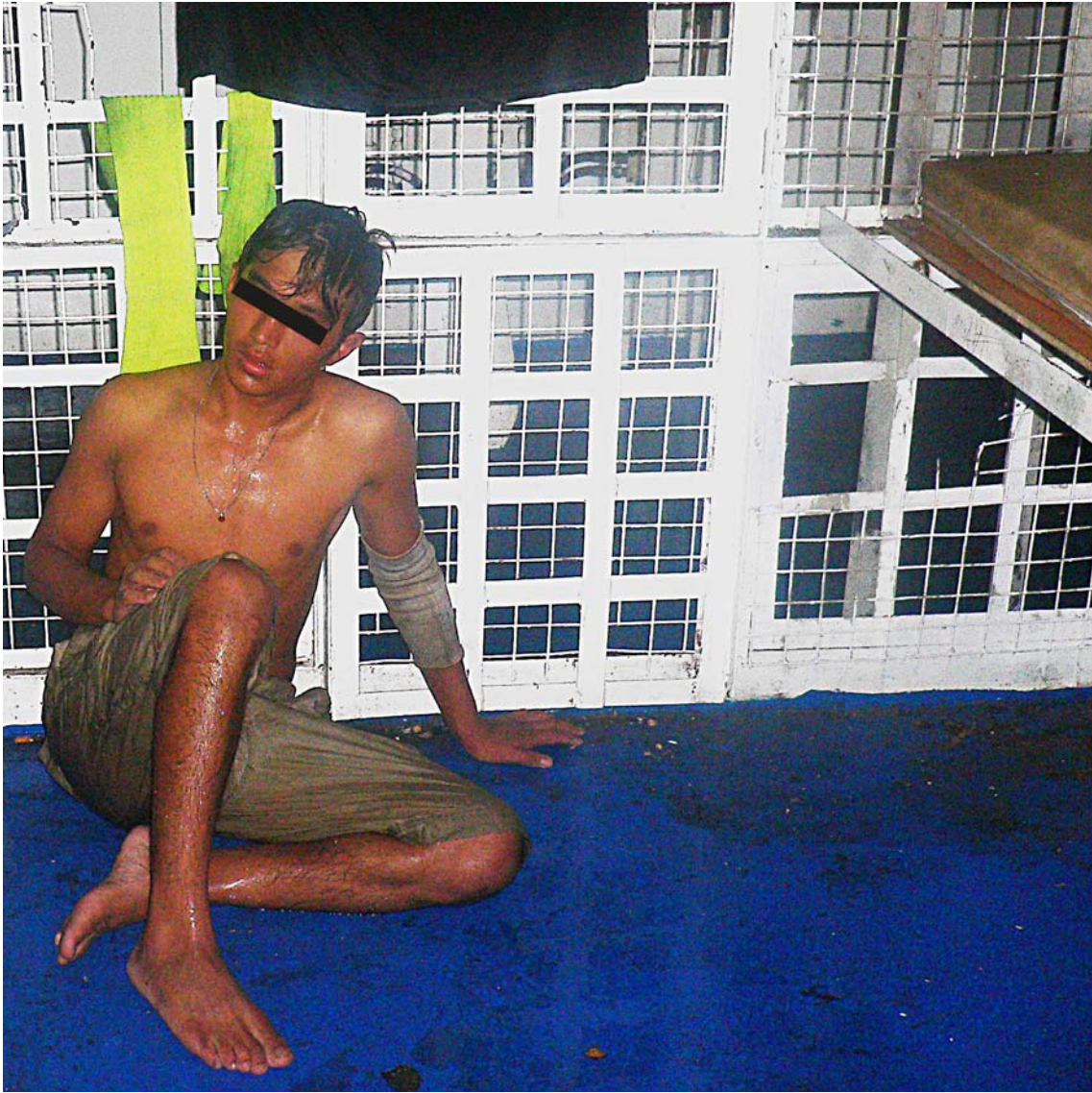
Readmission of unaccompanied minor