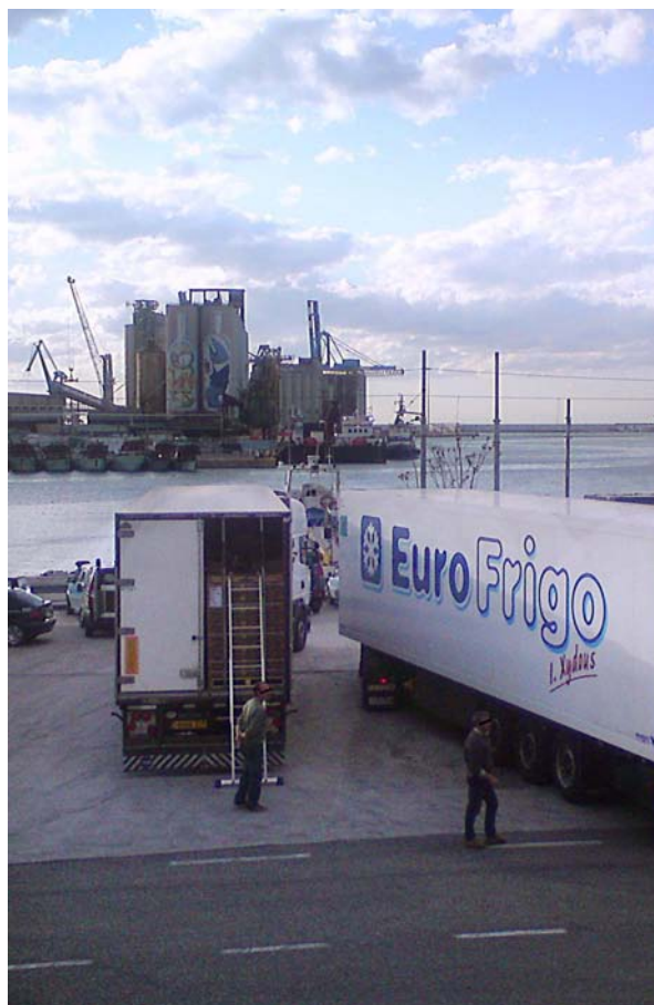
Control of trucks in the port of Ancona

Also two families, who reported to the Italian authorities that they have family members legally residing in other EU-countries, were not informed about the possibility to apply for asylum in Italy, thus, their right to family reunification under Dublin II. They were just readmitted back to Greece. GCR was contacted via mail by GUS organization, which requested support for the readmitted families in order to start the procedure of family reunification in Greece.