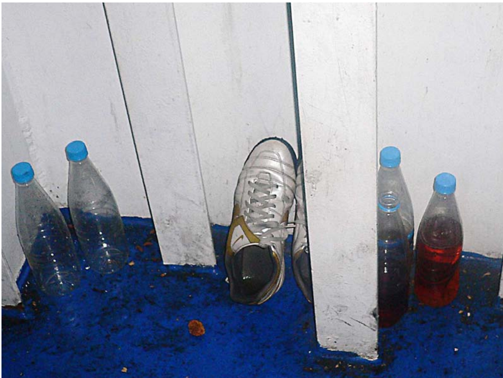
Lack of access to toilettes during readmission forces the people affected to urinate into bottles