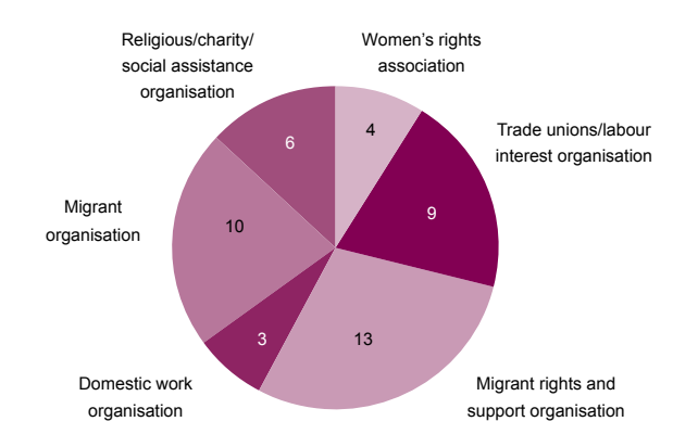
Figure A3: Type of organisation in absolute numbers

Note: Some of the domestic work organisations also focused their work on migrant domestic work.