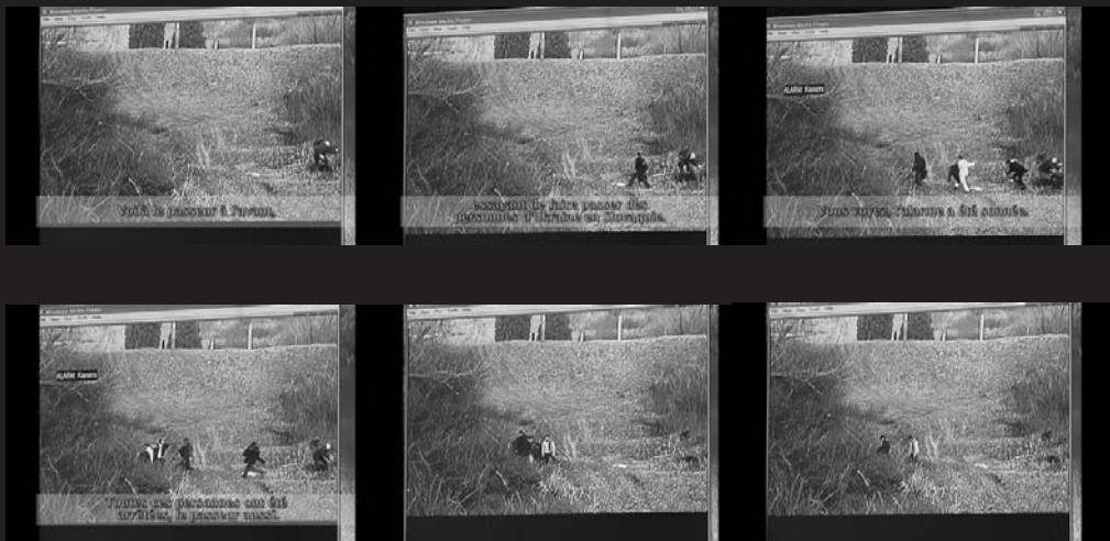
Video-surveillance at the Slovakian border