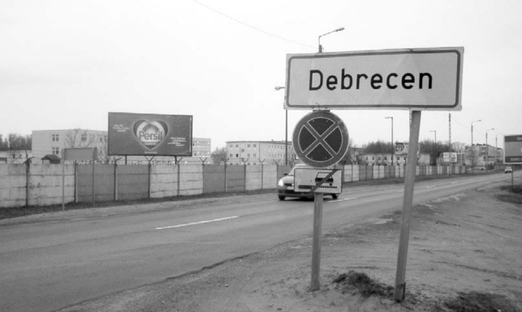
Refugee-camp in East-Hungary