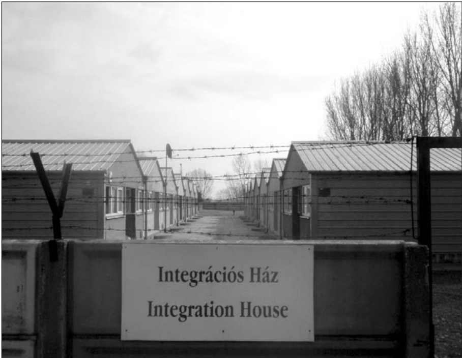
Refugee-camp in East-Hungary

only 152 asylum claims were registered at the same border section. Two potential interpretations: First, refugees had difficulties in accessing the asylum procedure and were not considered as asylum seekers by Hungarian authorities. Second, intercepted foreigners did not wish to seek asylum in Hungary (for various reasons, no integration, difficulties in family reunification, another destination country in Western Europe etc.).