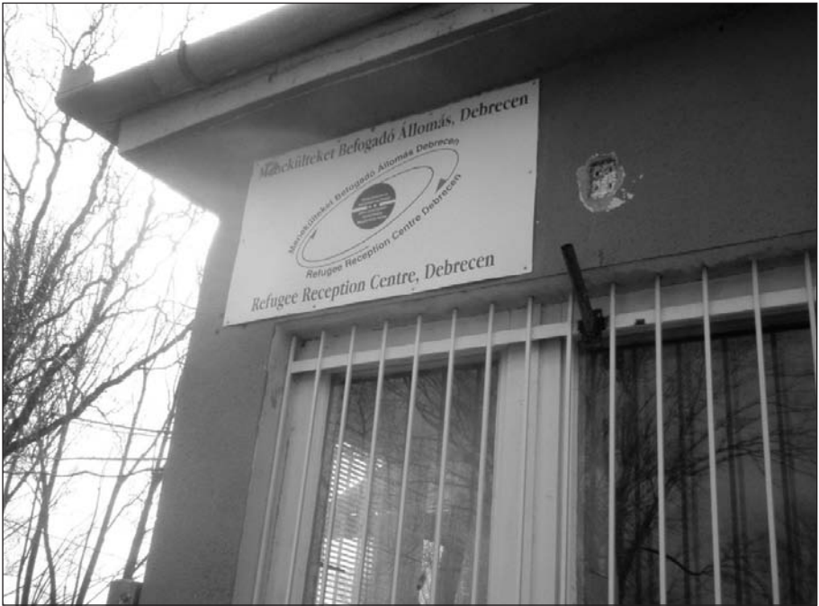
Refugee-camp in East-Hungary

to our clients, even if they stated to the police officer that they wished to seek asylum in Hungary, their claim was not registered. Moreover, based on the OIN's finding that Ukraine constitutes a safe third country in respect of the foreigners' citizenship (Somalia and Afghanistan), these foreigners had been readmitted to Ukraine several times. All of them claimed that they had faced serious difficulties and hardship in Ukraine after their return, and had been all detained for several months under very difficult, often degrading conditions. After several unsuccessful attempts to cross the Hungarian-Ukrainian border, however, they managed to gain access to Hungary and to the Hungarian asylum procedure, which eventually resulted in them obtaining international protection statuses.