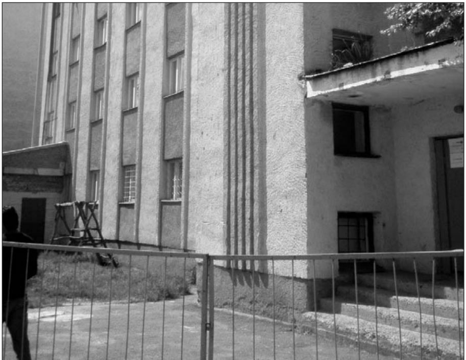
Detention Center Mukachevo

entails the risk of being chain-deported to the country of persecution. The fact that Ukraine actually sends refugees back to their home countries has been proven in the past. For example, in 2006 the following case of refoulement from Ukraine was published in international Media: Ukraine extradited eleven refugees to Uzbekistan without access to any asylum procedure, where their life and security was in extreme danger. UNHCR protested against the deportations, but without any success. There were even more cases of refoulement in the following years. Amnesty International reported cases of refugees from the Congo who were deported to the Congo in 2009 without having their cases examined in accordance with asylum laws.