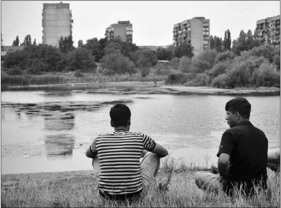
Refugees in Uzhgorod, Photo: Dörthe Hagenuth

Fatima's example shows, the situation has not improved in recent years, although several politicians in charge promised to comply with minimum standards of the EU concerning the admission and treatment of asylum-seekers. But the cases documented in this brochure, demonstrate that little has changed. The reports, which are based on interviews with refugees over the past two years, show that international refugee laws are systematically violated at Europe's Eastern border.