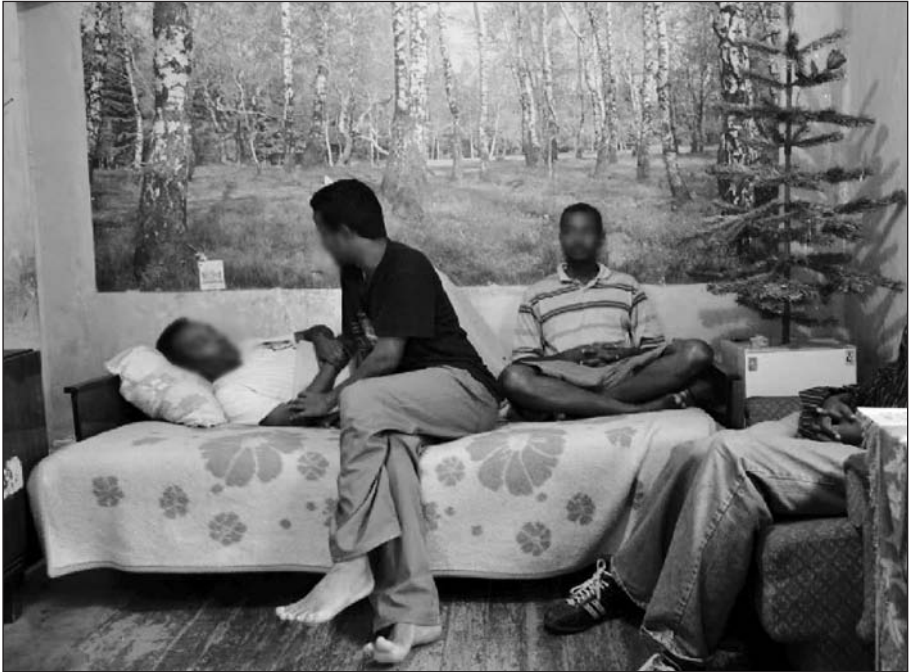
Refugees in Uzhgorod, Photo: Dörthe Hagenguth

Detention Centre. This detention centre was built in 2008 as part of the Capacity Building in Migration Management (CBMM) programme, a project funded by the EU and implemented by the International Organization for Migration (IOM). Actually, Volyn Detention Centre is one focus of the CBMM follow-up project GUMIRA . This IOM-project, cooperating with different Ukrainian NGOs, should also support (potential) asylum-seekers in filing their claims: