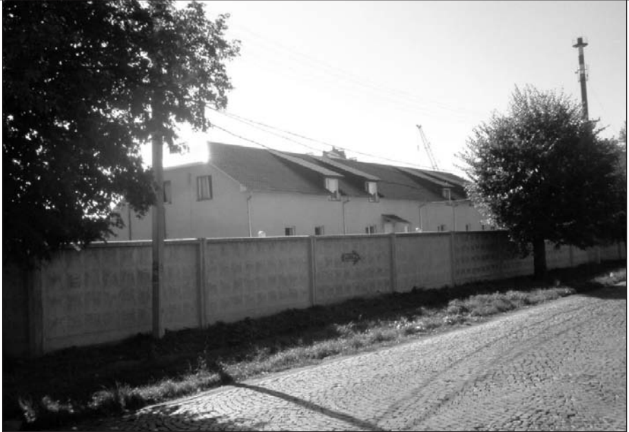
Temporary Accommodation Centre Mukachevo

Many refugees are denied access to asylum procedures. For instance, unaccompanied minors require a State Guardian to file their application for asylum, but due to administrative obstacles such as guardians are rarely available. As a consequence, many unaccompanied minors might not have access to asylum procedures.