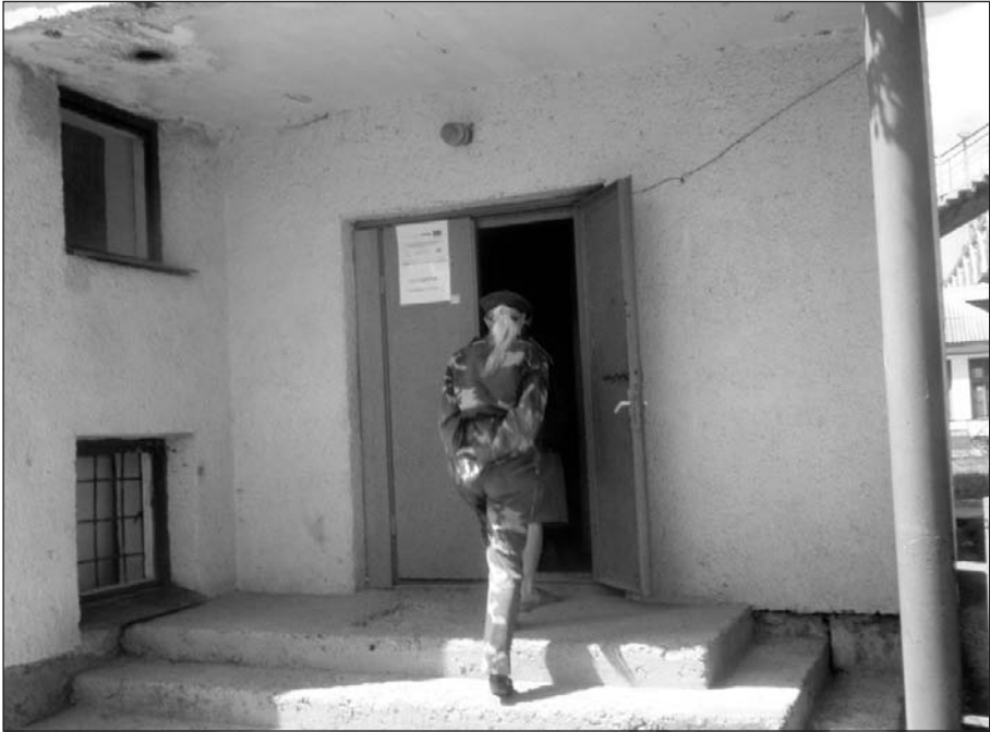
Detention centre Mukachevo

being returned to the country where the person concerned would be in danger of persecution. The Non-Refoulement principle also leads to some specific implicit obligations of the states and – in turn – to the rights of the asylum seekers. As an implicit right, the Non-Refoulement principle also contains: