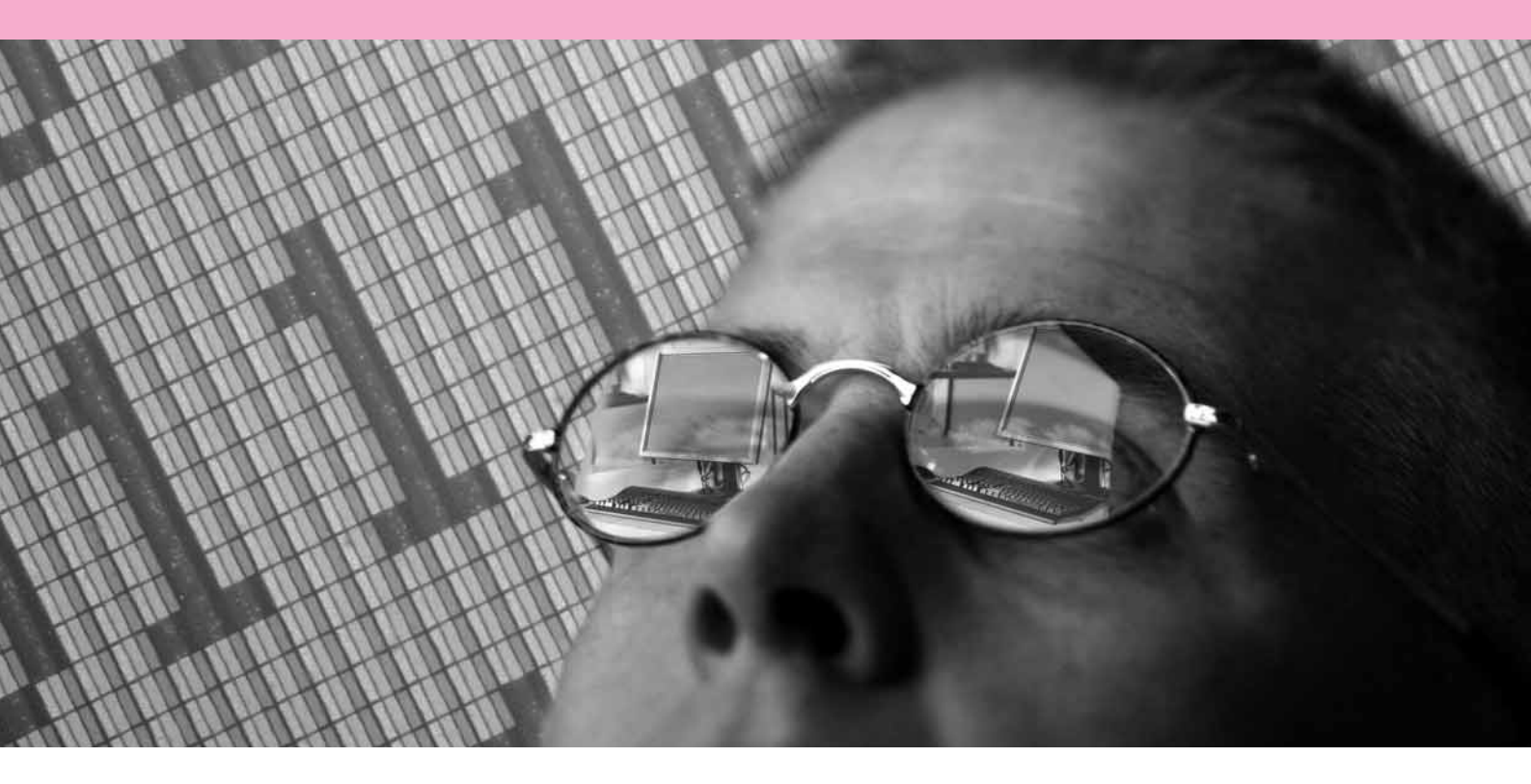
DISCLAIMER: The data and information used for this report were provided by the FRA research network FRALEX. The responsibility for its conclusions and opinions lies with the European Union Agency for Fundamental Rights.