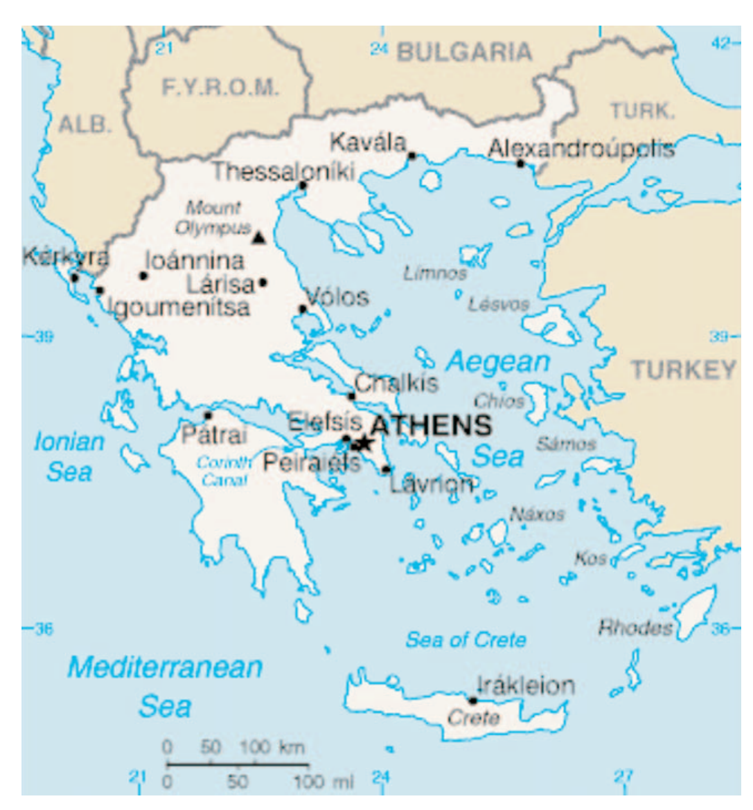
Map of Greece. CIA World Factbook.