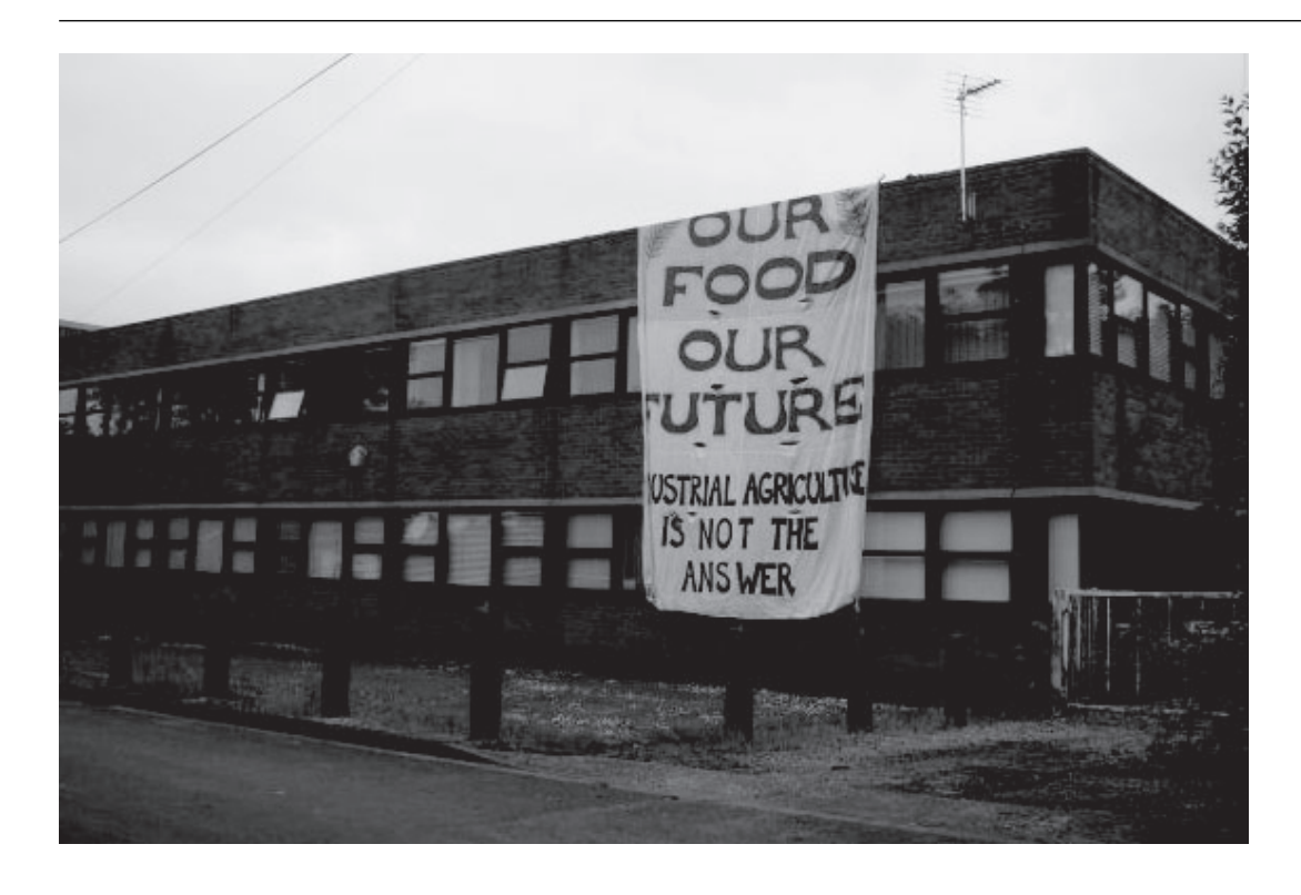
Protest at NIAB—http://www.indymedia.org.uk/en/2008/06/400028.html

Likewise, there were protests at the BASF site in Cheshire that shut down the site for many hours, denying employees access to their place of work.