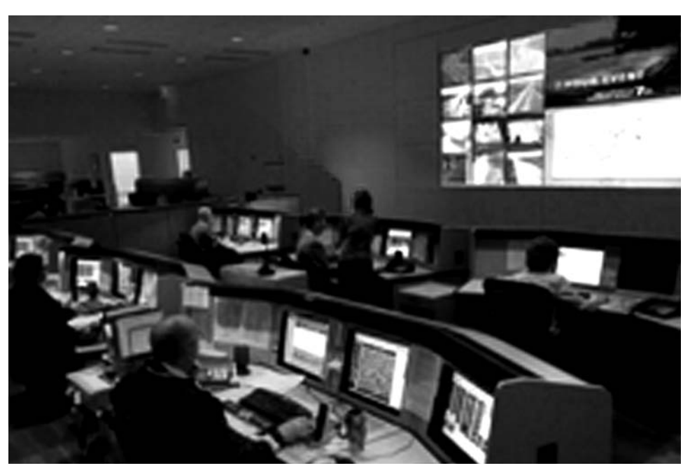
Kentucky's Fusion Center.