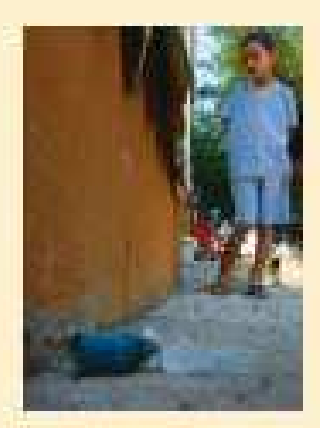
A young boy sear as M-42 submunition next to his house. So far thousands have been found in and near houses. Nabatiyyah, Lebanon

Over half a century has passed since the design and first use of cluster munitions. Ensuing decades have seen both casualties accumulate, and the use of these munitions proliferate. Spreading through new conflicts to destroy lives, disrupt communities, and deny vulnerable populations access to resources needed for economic recovery, cluster munitions simultaneously assure both a costly and lethal legacy of war for post-conflict generations.