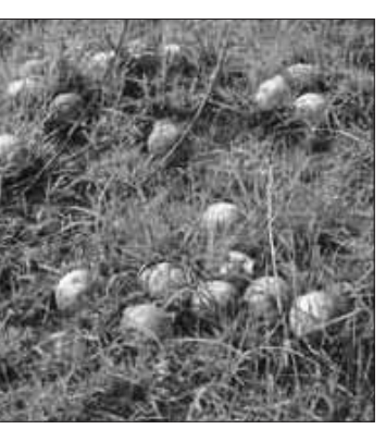
O Handicap International

ties for whom not all the required details were recorded) shows that males are most at risk and accounted for 84 percent (3,911) of all cluster submunitions casualties, with men representing 48 percent (2,257) and boys 36 percent (1,654), respectively. Boys make up nearly 86 percent of child casualties (1,929). Women accounted for 10 percent (470) and girls for six percent (275) of the total.