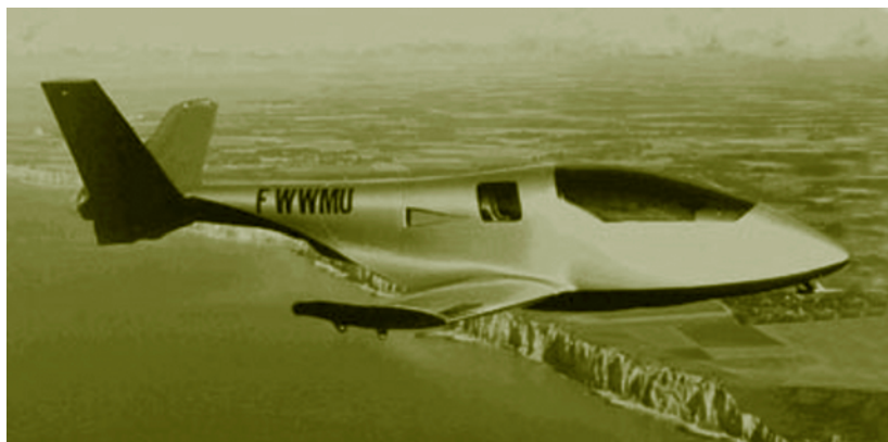
Dassault Aviation's maritime surveillance drone 83

“BSUAV” – “Border Surveillance by Unmanned Aerial Vehicles (UAVs)” – which the Commission calls “UAVs for peacetime security”, seeks to “understand the problems posed by various types of borders and to define realistic UAV based systems that would answer to those problems”. 81 But are UAVs the answer? According to a report to the US Congress in 2005, the UAV accident rate is 100 times higher than that of manned aircraft. 82