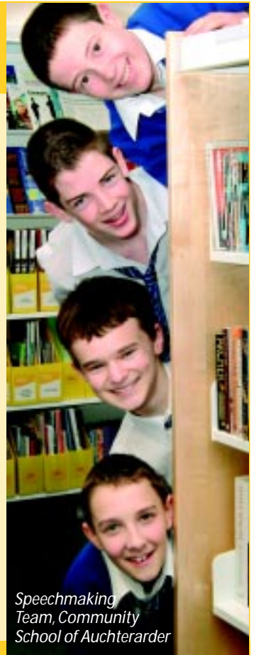
Speechmaking Team, Community School of Auchterarder

For further information about these events and activities go to www.perthshireg8.com or contact Perth & Kinross Council.