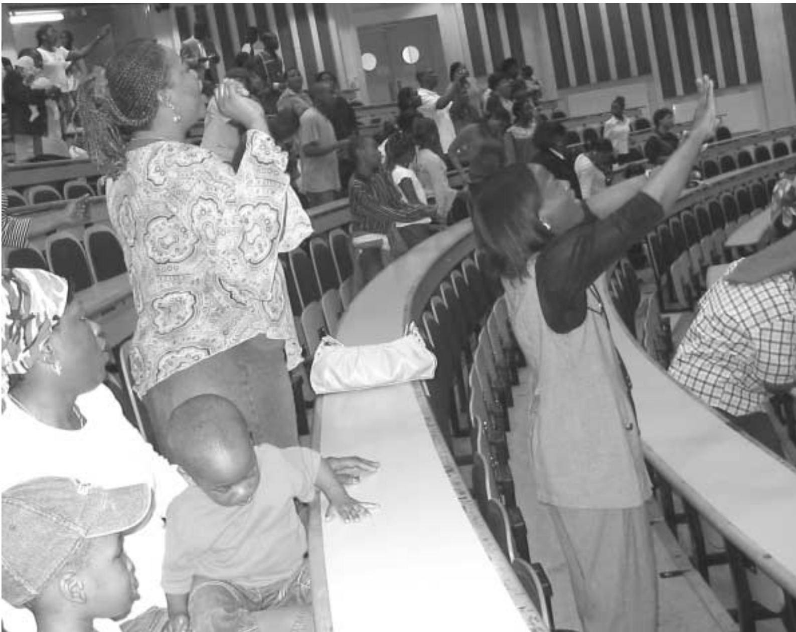
This is an African Pentecostal Church meeting, photograph taken in Dublin 2004. Photograph kindly provided by Abel Ugba, Department of Sociology, Trinity College Dublin, from his Ph.D. research on the religious practices of African migrants living here.

Government, and not the law, which the people of Ireland must rely on to ensure that their economic and social rights are vindicated, the Government's First Report must be viewed in this light. The Committee must consider why, if the Government believes that the rights enshrined in the Convention are sufficiently important for Ireland to ratify, it has refused to bring the Convention fully into Irish law.