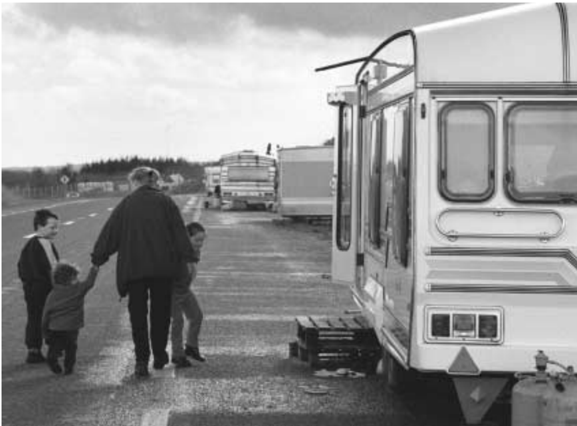
On the road; a nomadic lifestyle.