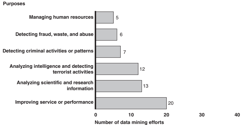
Figure 3: Top Six Purposes of Data Mining Efforts That Involve Data from Other Federal Agencies