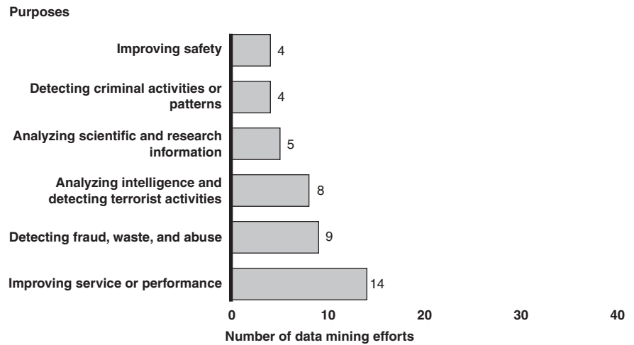
Figure 2: Top Six Purposes of Data Mining Efforts That Involve Private Sector Data