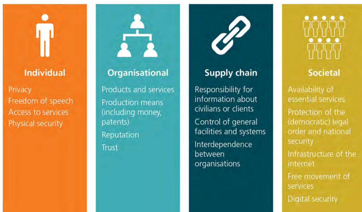
Figure 1. Targets and their interests 29

To understand why a threat is perceived as such, it requires a connection to a target with specific interests that a perpetrator wants to influence. This section identifies these targets and interests. In cybersecurity threat assessments, targets generally include individuals (consumers and citizens), governments and corporations. Threats can implicate more than one target but the consequences may be different for each target because they hold different interests. CSAN identifies four main categories of interest: individual, organisational, supply chain and societal (see Figure 1).