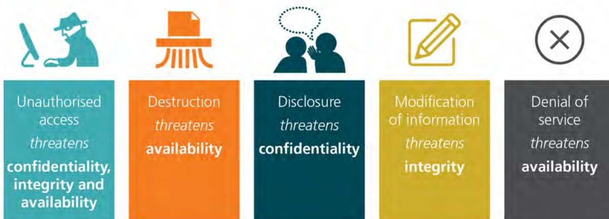
Figure 2. Threat types and information security principles

the NIST definition (see Section 2.2). These threat types can be connected to the core principles of the concept of information security: confidentiality, integrity and availability. 118 These can be mapped as shown in Figure 2.