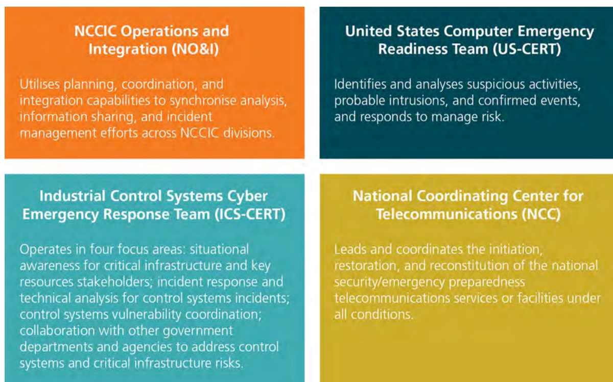
Figure 6. NCCIC branches