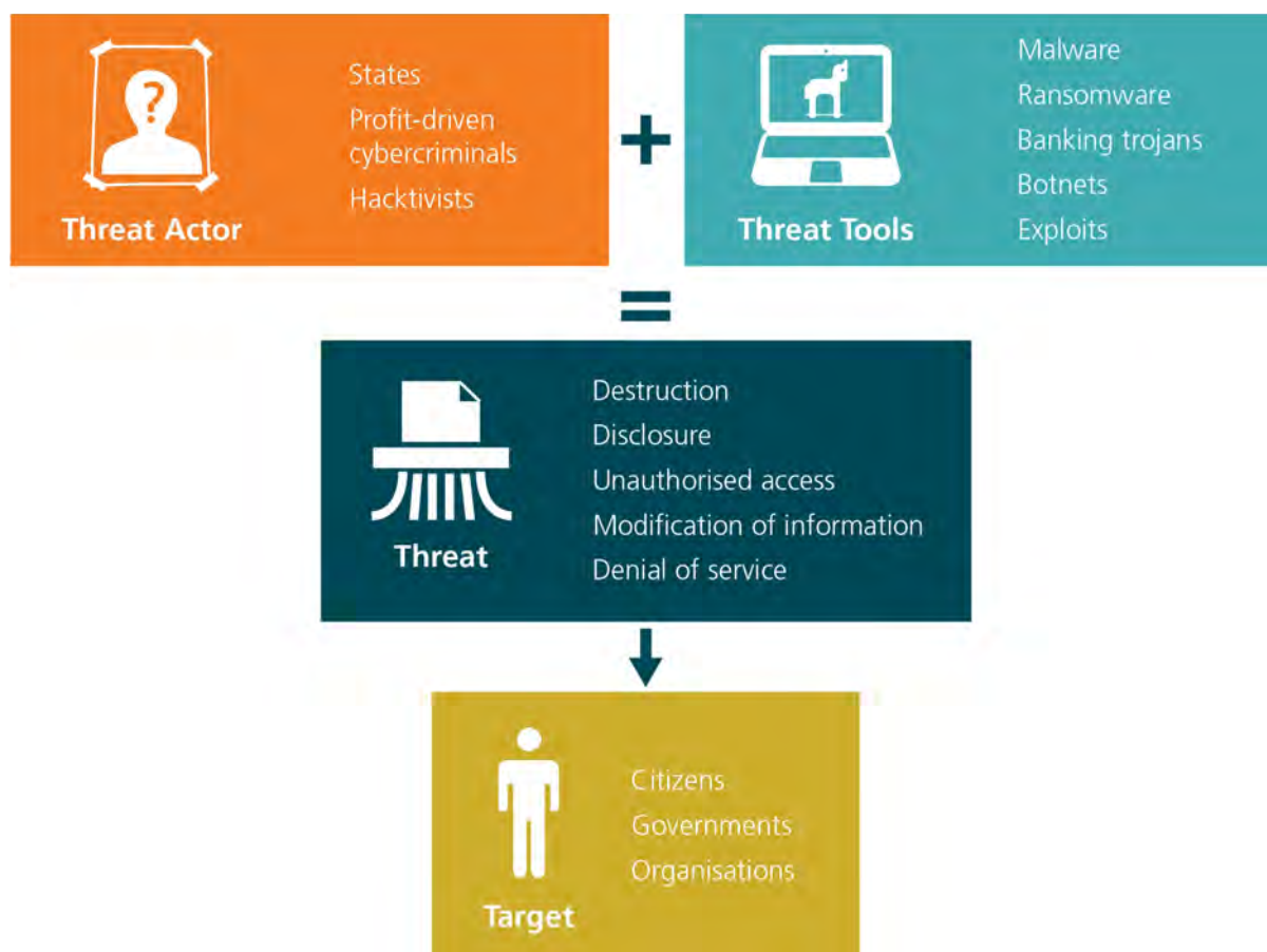
Figure 4. Threat components: actor, tools and targets