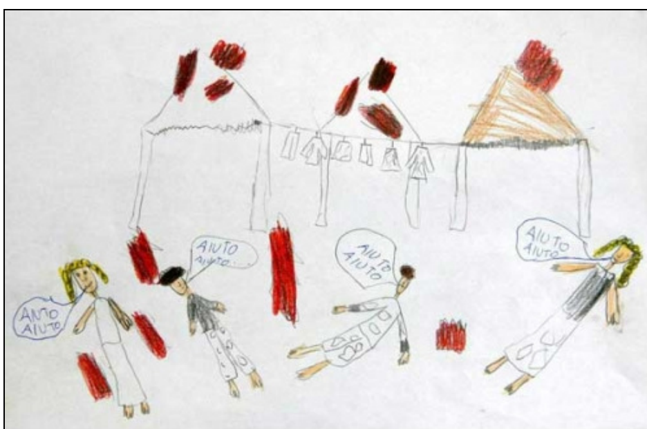
Children's drawings inspired from the events in Ponticelli ("help, help") 12

families. Using wooden and metal clubs, the attackers succeeded in pulling down the metal fence. Once inside the camp, they shouted insults and threats, threw stones against shacks and caravans, and overturned some cars. At about the same time an abandoned building which until two days before had been used by six Roma families was set on fire. In two separate incidents on the same day, two Roma boys were beaten by a gang of local boys and a small pickup owned by a Roma person was set on fire. 10 Two Roma women were harassed and driven out of a supermarket close to one of the big camps while they were shopping. 11