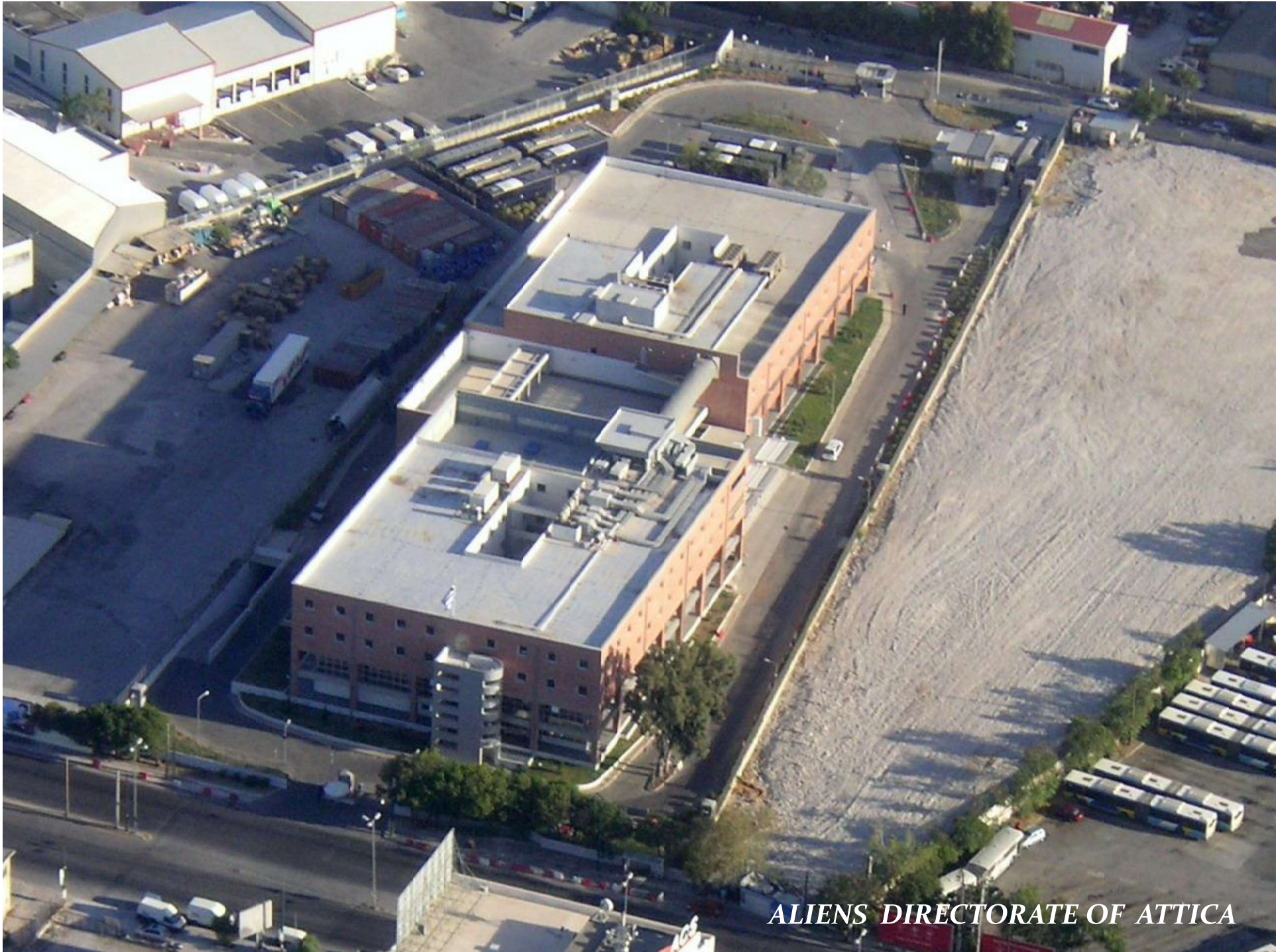
ALIENS DIRECTORATE OF ATTICA